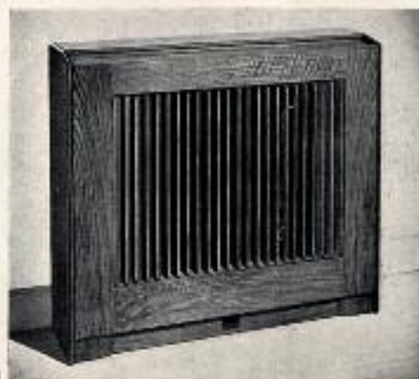
A: Receiver and Projection Unit. B: Screen and Speaker Unit of the Decca Dual-Unit Front Projection Television Receiver.