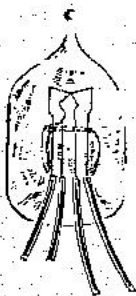
Standard range, 12-15 millivolt output

Heater resistance tolerance: \pm 10\% Couple resistance tolerance: \pm 10\% Couple output tolerance: \pm 12\% Insulation: 100 V d.c.